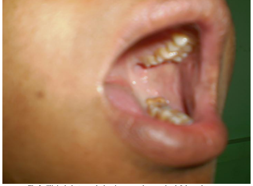
Fig 2: Clinical photograph showing normal appearing left buccal mucosa