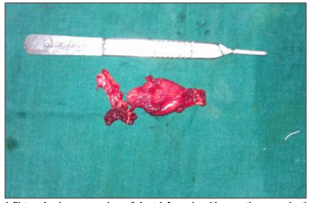
Fig. 4: Picture showing gross specimen of about 4\times2 cms size with supporting connective tissue.