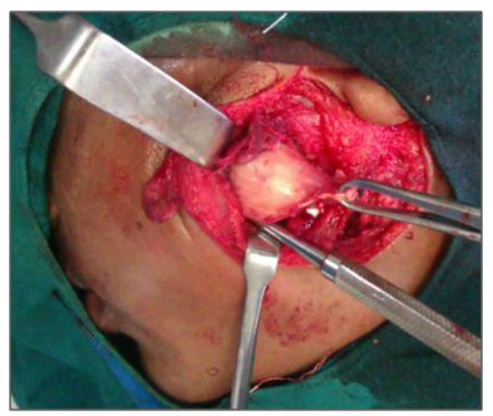
Fig 3: Photograph showing surgical exploration of the lesional tissue in preauricular region