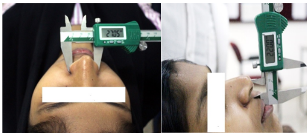
Fig. 1: Evaluation using vernier caliper (direct measurement)