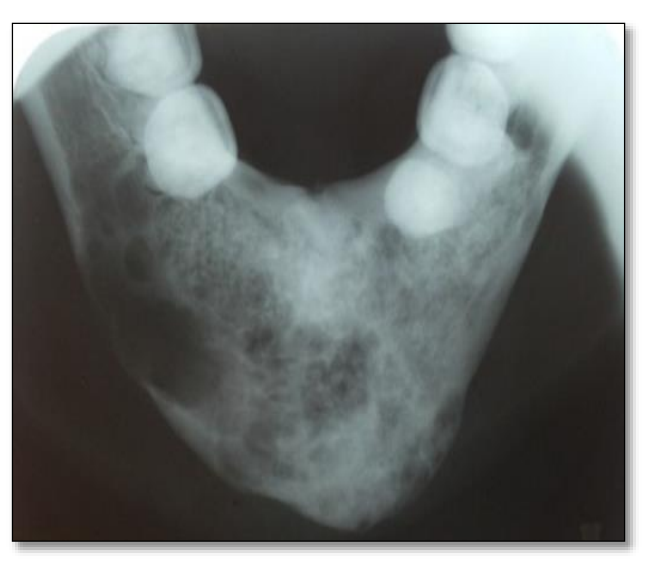
Fig. 4: Mandibular Crossectional Occlusal Radiograph reveals expansion of cortical plates.