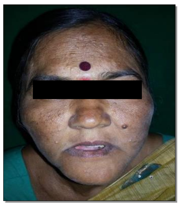
Fig. 1: profile photograph