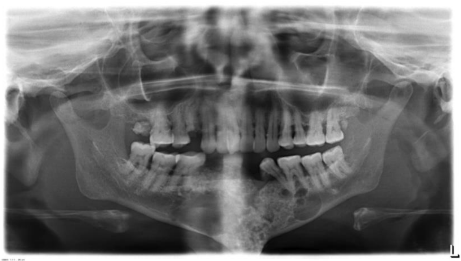
Fig. 5: Orthopantomograph revealed well- defined multilocular appearance with sclerotic border