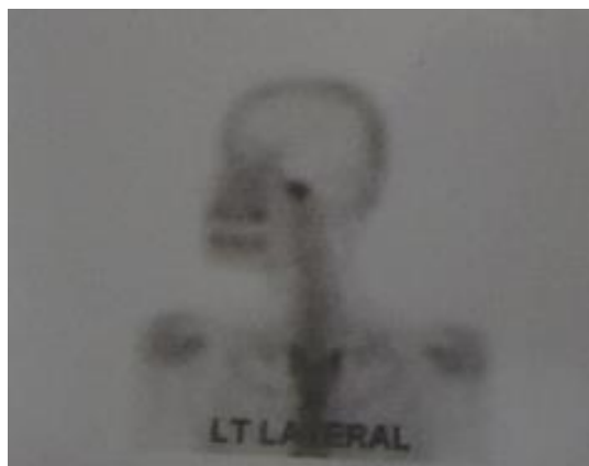
Fig. 4: Bone scintigraphy scan revealing focus of increased tracer uptake involving the left condyle.