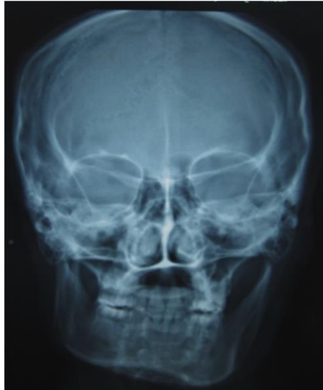
Fig. 3: Postero Anterior Cephalometric radiograph reveals a prominent left side of mandible with increase in size of condylar head and neck with slanting of the occlusal plane