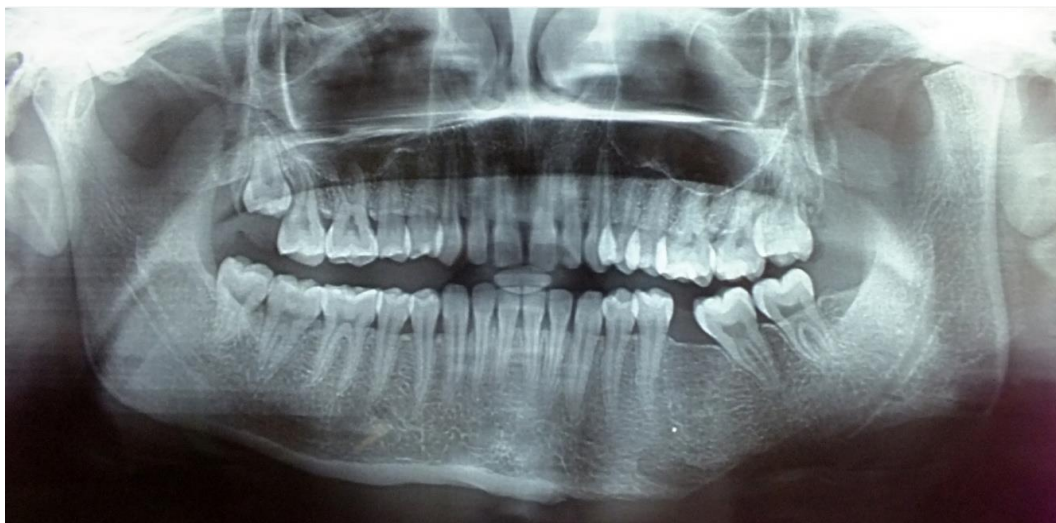
Fig. 6: Post-operative panoramic radiograph after 15days of surgery