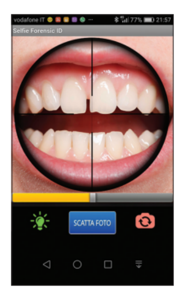
Fig. 2: A selfie picture of visible teeth within the centering grip of the selfie forensic ID App

Image courtesy: Nuzzolese E, Lupariello F, Di Vella G. Selfie identification app as a forensic tool for missing and unidentified persons. Journal of forensic dental sciences. 2018 May;10(2):75.