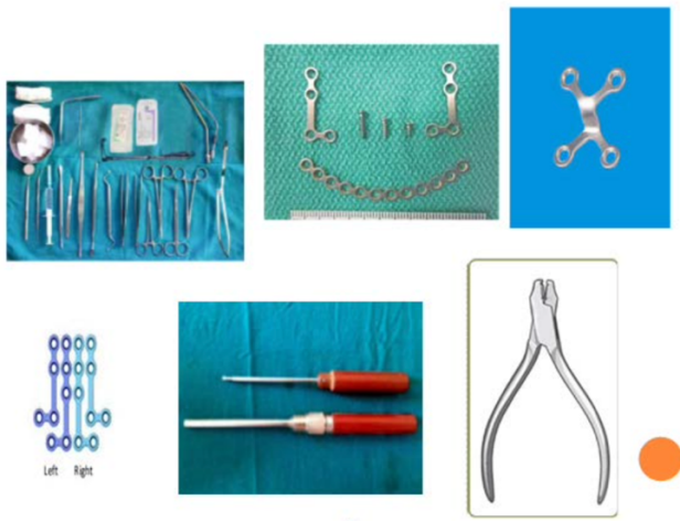
Figure 5: Basic armamentarium for open reduction and internal fixation

two-point fixation group, nearly all patients had a post-operative scar; in the one-point fixation group, however, only two patients had the same scar, and the mouth opening was also improved. In two-point fixation, paresthesia was observed in nearly seven patients, while in one-point fixation, it was present in only two patients. (Tables 1, 2, 3, 4, 5 and 6)