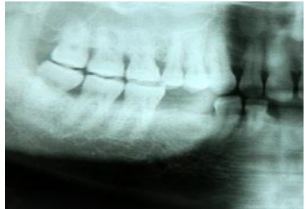
Fig 5. Postoperative radiograph