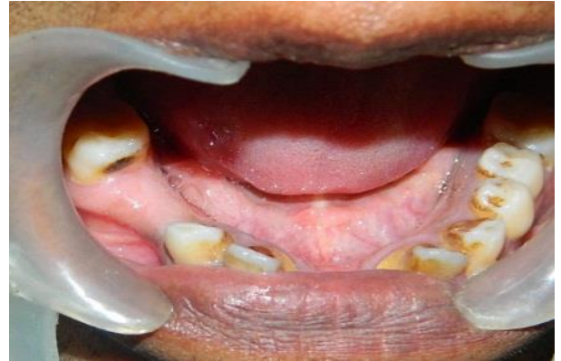
Fig. 4: Postoperative view of the region