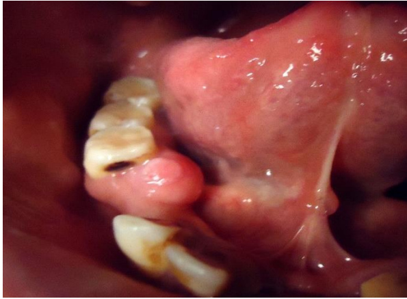
Fig. 1: Preoperative view of the lesion