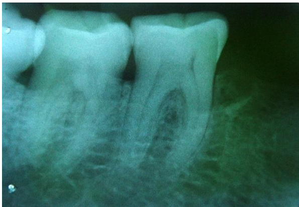
Fig. 2: Preoperative radiograph