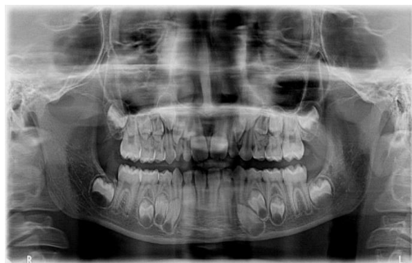
Fig. 4: Orthopantomograph