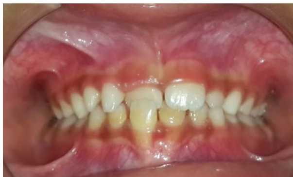
Fig. 1: Intraoral photograph showing anterior single tooth crossbite w.r.t 11 in occlusion view