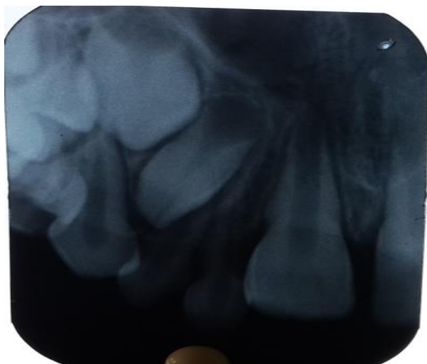
Fig. 2: Intraoral periapical radiograph w.r.t 11