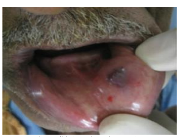
Fig. 1: Clinical view of the lesion

A 60 year old male patient reported to the department with a chief complaint of growth and bleeding from the left side of the lower lip since 15-20 days. Patient gives history of excision of same growth around one and half month backusing laser. At the initial consultation, the patient had a good general condition with normal vital signs. (Fig. 1)