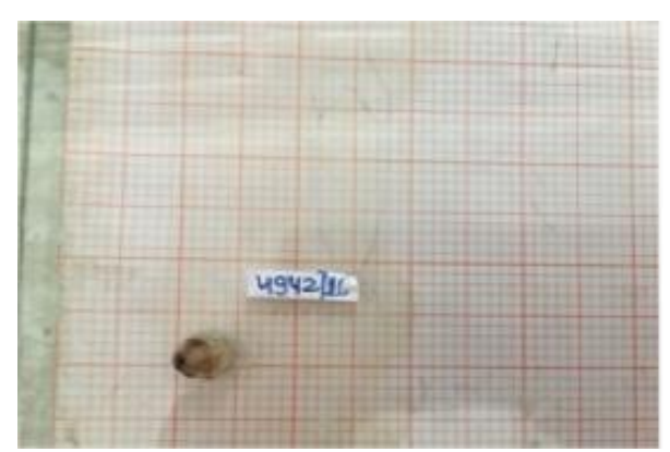
Fig. 3: Gross tissue specimen

On histopathological examination the section revealed various sized cystic structures lined by spindle shaped neoplastic cells arranged in sheets in solid pattern. The lesion is incompletely surrounded by scanty connective tissue stroma and few areas show clear cells which lead to the histopathological diagnosis of Cystadenoma.(Fig. 4, 5)