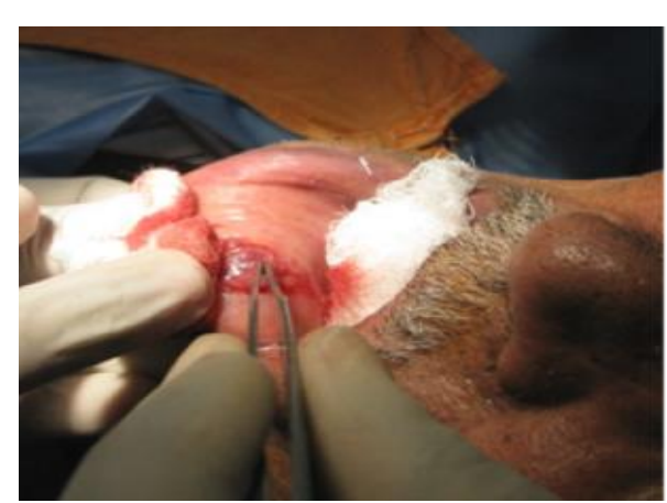
Fig. 2: Surgical excison of lesion

On inspection growth was soft, painless to finger compression and was reddish pink in colour, thereforea provisional diagnosis of mucocele was done. Excision biopsy was performed under local anaesthesia and the specimen was sent to department of oral pathology and microbiology for final diagnosis. (Fig. 2)