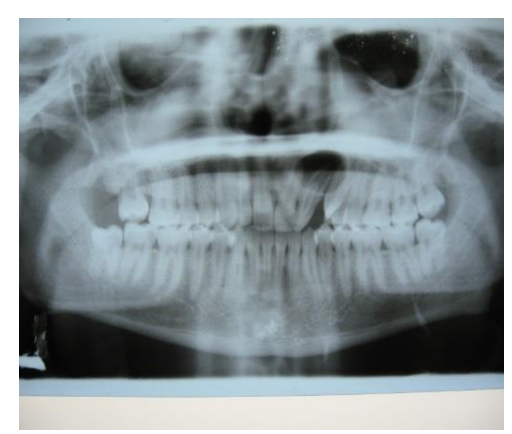
Fig. 4: Panoramic Radigraph showing right maxillary lateral incisor with oehlers' Type IIIA causing a periapical radiolucency superimposing on roots of right maxillary central incisor and right maxillary canine.