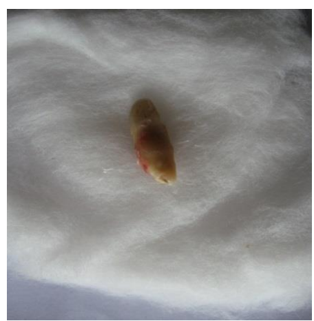
Fig. 5: Extracted peg shaped right maxillary lateral incisor