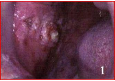
Fig. 1a: Suspected innocous lesion

The subject is asked to rinse the mouth with the dye. Afterwards subject is inspected for the areas of blue staining. Depending on the degree of dysplasia, malignant lesions stain dark blue and dysplastic lesions stain with different shades of blue. (8) Blue staining in a patient is indicative of biopsy. Occasionally, the normal mucosa or rough or keratin surfaces (e.g., dorsum of the tongue, gingival crevices) may retain a small amount of dye, which can be wiped away with acetic acid. Similarly, nonmalignant areas of inflammation occasionally stain with toluidine blue therefore it is mandatory to restain all positive lesions within 14 days to lessen the false positive cases. (Fig 1a-d). This is a highly sensitive and moderately specific for malignant lesions, it is far less sensitive for pre-malignant lesions and false negative rates of up to 58% has been reported.