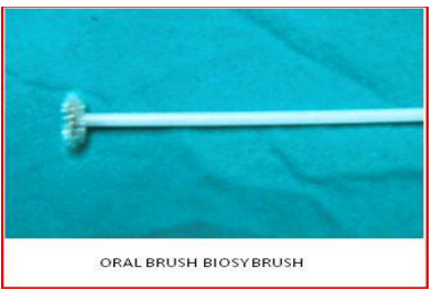
Fig. 2a: Oral brush biopsy brush