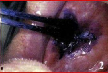
Fig. 1b: Application of 1% toluidene blue dye