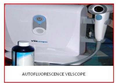
Fig. 4: Autofluorescence with velscope

Use of tissue autofluorescence has been traced back for the screening and diagnosis of pre-cancers and early cancer of the lung, uterine cervix, and skin. More recently, it has been used in the oral cavity. The changes in the structure and metabolism of the epithelium and sub-epithelial stroma alter their interaction with intense blue light (400 to 600 nm).<sup>(10,28)</sup> Velscope system is a tissue fluorescence imaging system used for inspection of the oral mucosa. (10,12,29) (Fig. 4) Under the intense blue light (400 to 600 nm), normal oral mucosa emits a green auto-fluorescence, whereas abnormal areas absorb the fluorescent light and appear dark. Hence, early detection of pathological lesions is possible by detecting the early biochemical changes even before their evident appearance. VELscope system seems to be very promising due to its ability and effectiveness in identifying the visually occult lesions and lesions' margins.<sup>(29)</sup> The sensitivity values ranges from 97% to 98% and specificity from 94% to 100%.