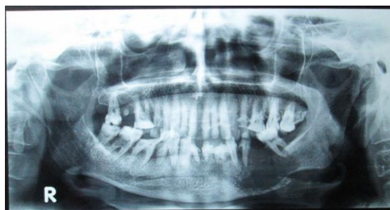
Fig. 2: Orthopantomograph of the patient