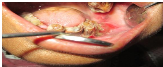
Fig. 1: Clinical examination showing infiltrative ulcer mandibular left gingivobuccal sulcus

The radiographic images were assessed by a medical and a maxillofacial radiologist independently. Any differences were resolved by consensus. An example of case is illustrated in Fig. 1-4.