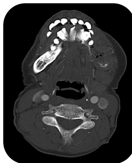
Fig. 3: Contrast-enhanced Computed Tomography (Bone Window)