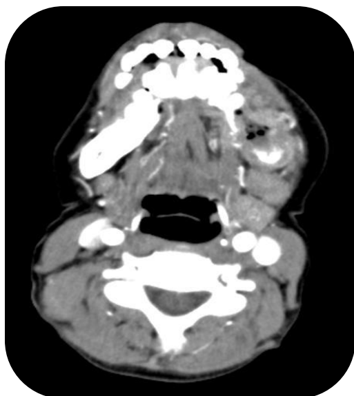
Fig. 4: Contrast-enhanced Computed Tomography (Soft-tissue Window)