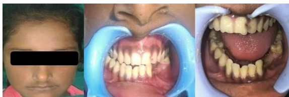
Fig. 6: Postoperative photographs after 6 months