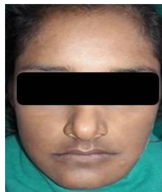
Fig. 1: Profile view showing mild asymmetry on left side of lower 1/3rd of face

diffuse swelling in the left mandibular region extending from the commissures to the inferior border of the mandible in superio-inferior direction and anterior border of the ramus to the chin area in postero-anterior direction.[Fig. 1] On intraoral examination, there was missing 33. There was a firm swelling extending from mesial side of 32 up to 36 regions, covering the occlusal surface of 35. There was obliteration of buccal and lingual cortical area in 32 and 36 regions. [Fig. 2a, and b]