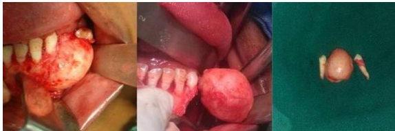
Fig. 4: Surgical procedure showing extracted tooth and excised lesions

Based on clinical examination and radiographical findings diagnosed as ossifying fibroma. Complete surgical excision of the lesion was done [Fig. 4] and sent for histopathological study which revealed mesenchymal tumour comprised of the thin wavy spindle cells arranged as fascicles and whorls with scattered spindle of dark blue osteoid material revealed nature of ossifying fibroma. [Fig. 5] Patient was reviewed post treatment follow-up after 6 months and found normal without any abnormalities. [Fig. 6,7]