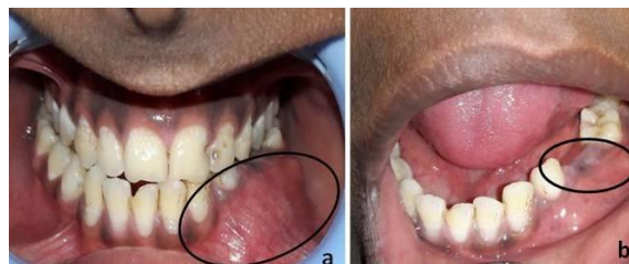
Fig. 2: Intra-oral view showing mild obliteration of left buccal vestibule (a) and missing 33 (b)