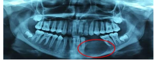
Fig. 7: Post-operative radiograph showing healed enucleated alveolar bony pattern