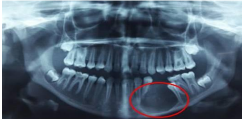
Fig. 3: Orthopantomogram revealed a unilocular radiolucency with multiple tiny radiopacities

Routine baseline investigations are non-contributory. On radiographic examination an orthopantomograph showed a well defined round unilocular radiolucency from the periapical region of 32 to 35 region mesiodistally and upto the inferior border of the mandible inferiorly. There were small areas of radiopacities seen inside the radiolucent region. [Fig. 3]