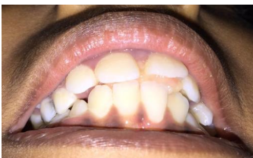
Fig. 2: Repeated trauma from mastication