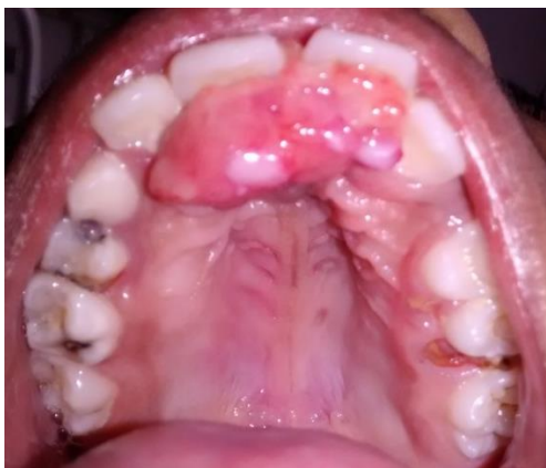
Fig. 1: A reddish-pink, firm swelling seen on the anterior aspect of the hard palate

Careful inspection of the patient and the excised site was carried out thereafter. There was no reactionary or secondary haemorrhage reported from the patient's end. The patient was recalled for frequent follow-ups up to a year to look for recurrence or any malignancy. The wound healing was satisfactory (Fig. 7) and no recurrence was noted.