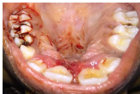
Fig. 3: Excision of the soft tissue mass from the base with cauterization