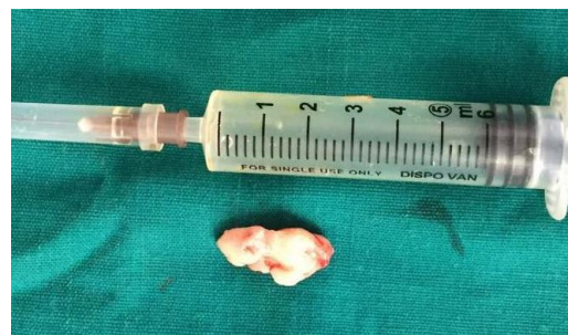
Fig. 5: Excised specimen