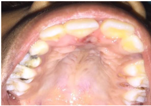
Fig. 7: Post-operative healing on the 3 rd day