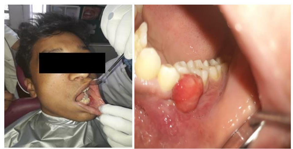
Fig. 1 and 2: Showing solitary, erythematous growth present in left mandibular premolar region