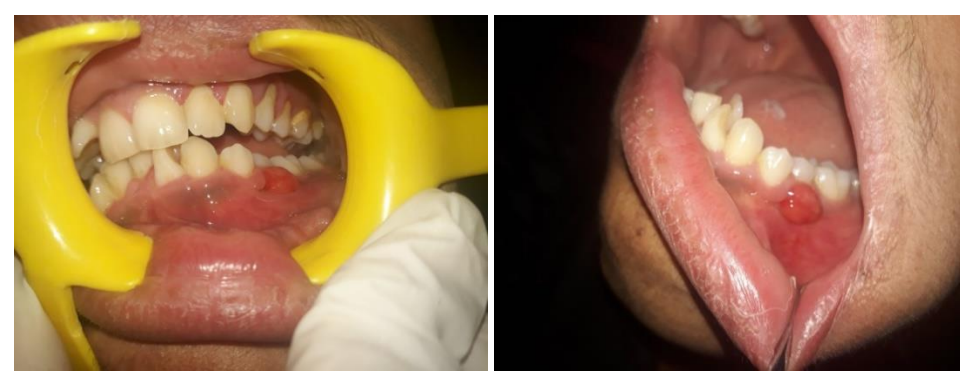
Fig. 3 and 4: Showing recurrence of lesion after 2 month of excision.

Fig. 1 and 2: Showing solitary, erythematous growth present in left mandibular premolar region