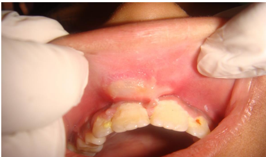
Figure 3: Intraoral photograph showing cystic lesion.