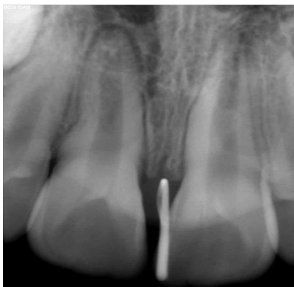
Figure 5: Intra-oral periapical radiograph with Gutta percha point