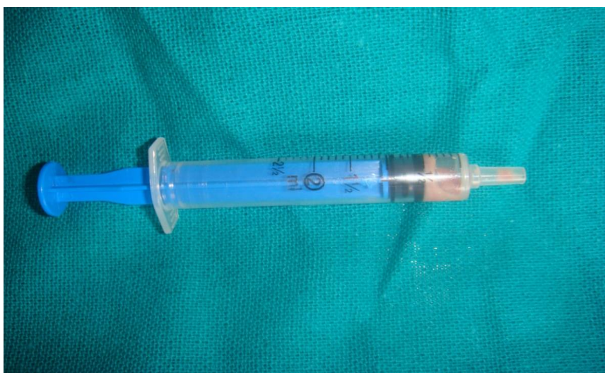
Figure 4: Blood tinged creamish discharge on aspiration