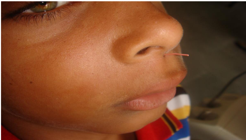
Figure 2: Extraoral photographs with sinus in region of philtrum & obliteration of nasolabial sulcus.