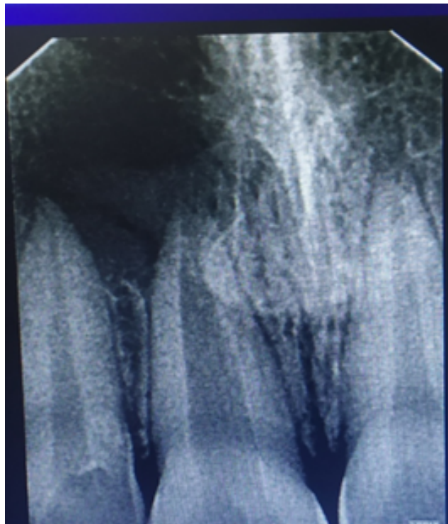
Fig. 1: Preoperative radiograph

The calcium hydroxide dressing was changed every 1 week for four times. As the discharge did not cease completely and the symptoms still persisted, the treatment procedure was changed. The canals were irrigated and dried, a triple antibiotic paste consisting of ciprofloxacin, metronidazole, and doxycycline was placed in the canal with the help of a lentulo spiral and teeth were temporized. The paste was changed every month for a period of 4 months until the teeth displayed no symptoms. On examination, the teeth showed no pain on percussion, soft tissues were found healthy, and the canals were dry. The canals were irrigated with 3.4% w/v sodium hypochlorite solution followed by normal saline and metronidazole solution, 2% chlorhexidine solution and obturated with 6% gutta-percha and AH 26 sealer after 4 months. After 24 months the radiograph showed complete bony healing with well-defined trabeculae.