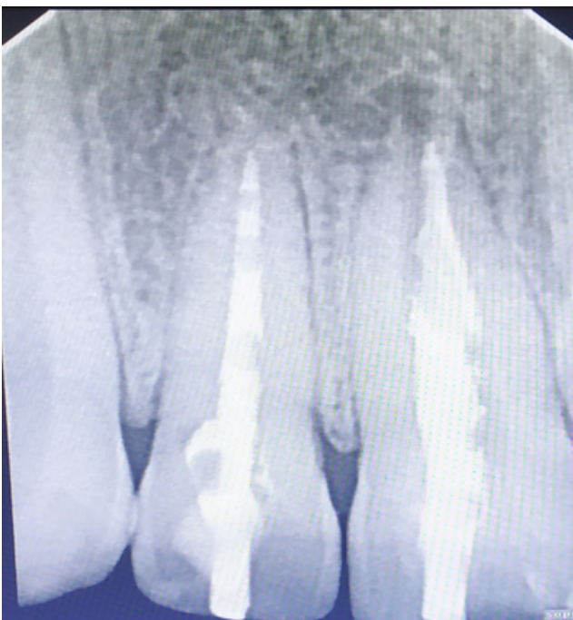
Fig. 4: Post-operative radio graph 2 yrs.