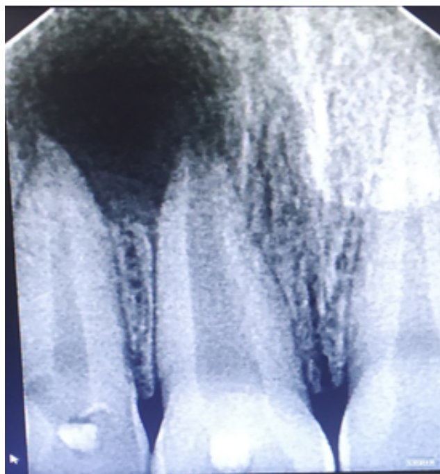
Fig. 2: Radiograph after 1 month