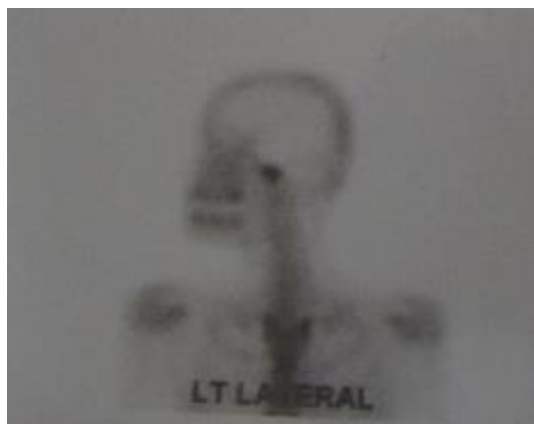
Fig. 4: Bone scintigraphy scan revealing focus of increased tracer uptake involving the left condyle.