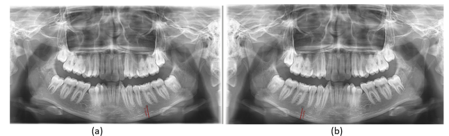
Fig. 2: (a): Showing the distance from superior border of mental foramen to base of mandible in females (b): Showing the distance from inferior border of mental foramen to base of mandible in females