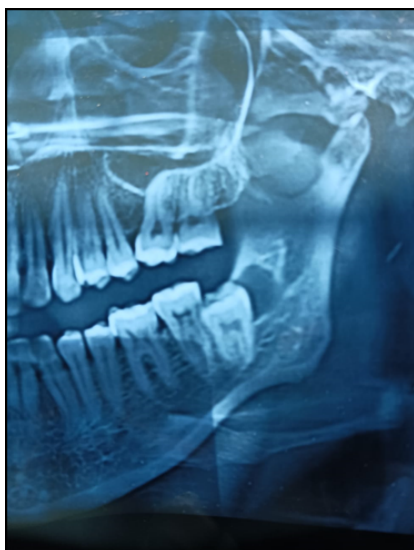
Fig. 2: Radiographic view with radiolucency around the crown of impacted 3 rd molar

The case in the present editorial reports a similar case where such picture of ameloblastomatous transformation along the lining of DC was observed. The findings are similar with the case published in the year 2017 where the occurrence of the tumorous changes away from the cystic lining of DC, features of VG criteria and presence of unerupted tooth in the proximity confirms the occurrence of an ameloblastoma arising from the lining of DC. 2 (Figure 2)