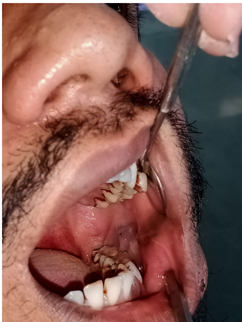
Figure 2: Intraoral finding with partially erupted 38

On intraoral examination, there was partially erupted 38 and vestibular obliteration extending from 34 to 38 which was soft to firm in consistency. (Figure 2)