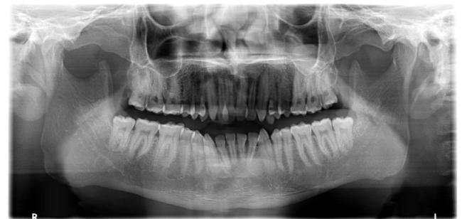
Figure 4: OPG showing semilunar radiolucency with respect to 38. A soft tissue shadow was seen on the coronal aspect of 35, 36, 37, 38

The OPG showed semilunar radiolucency with respect to 38. A soft tissue shadow was seen on the coronal aspect of 35,36,37,38. (Figure 4 )