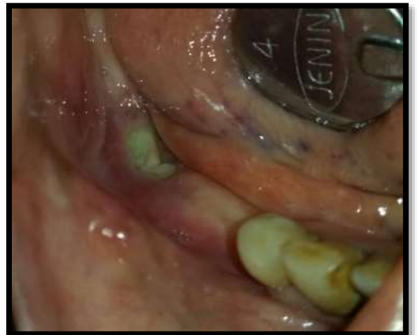
Fig. 1 b: Lesions from bisphosphonate-related osteonecrosis of the jaw at extraction site of lower right 2 nd molar (tooth no. 47)