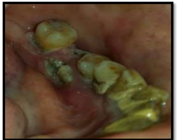
Fig. 1c: Bisphosphonate-related osteonecrosis of the jaw at the site of tooth #36. Necrotic, non-healing exposed bone extends up the tooth no #37