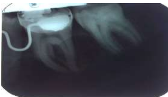
Fig. 4: Shows intra-oral periapical radiograph showing well defined radiolucency extending