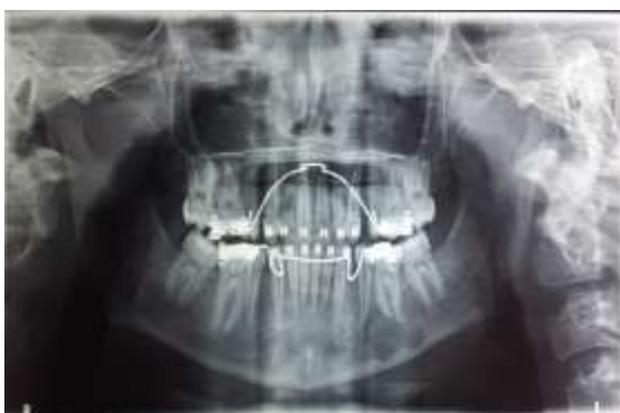
Fig. 3: Shows OPG after 6 months