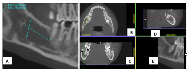
Figure 2: A,B,C,D,E): CBCT scan showing a well defined hypodense lesion in mandibular body (47 and 48 region). Black arrowhead in 2C showing thin buccal wall of decayed 47. White arrowhead in 2E showing scalloped border interdentally