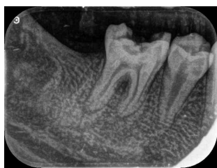
Figure 3: Radiographic evaluation of operative site after 04 months shows decrease in hypodensity with trabecular bone

lesion occurs in the orofacial region. In orofacial region, it commonly occurs in the mandible; in the premolar- molar region, followed by the ramus and midline of mandible. 1,9 The maxillary lesion is rare and may occur in anterior maxilla or posterior maxilla. 1,7 This lesion is more prevalent in younger age group, usually in the second decade of life, as seen in our case. Male to female ratio is slightly higher or an equal ratio to male ratio. 7 It is a solitary lesion which is usually asymptomatic and less than 3cm in size but can also be multiple. Multiple cystic lesions are common in older females and in the maxillary region. Coexistence of other pathologies with SBC has been reported in some cases which include cementosseous dysplasia, apical periodontitis, and cementoma. Radiographically it is mostly unilocular and rarely multilocular with well defined borders; scalloped margins may extend among dental roots and usually. Uncommonly few cases have shown cortical expansion, thinning of cortical lining, root resorption or tooth displacement. 4,7,12