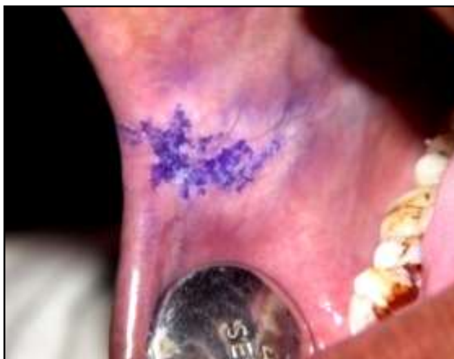
Fig. 1: Lesion with Toluidine blue positive stain

dysplastic and 3 cases were non dysplastic. So sensitivity for this group was 100% (Table 3). Since there were no cases of true negative so we cannot comment on specificity of this technique in this group.