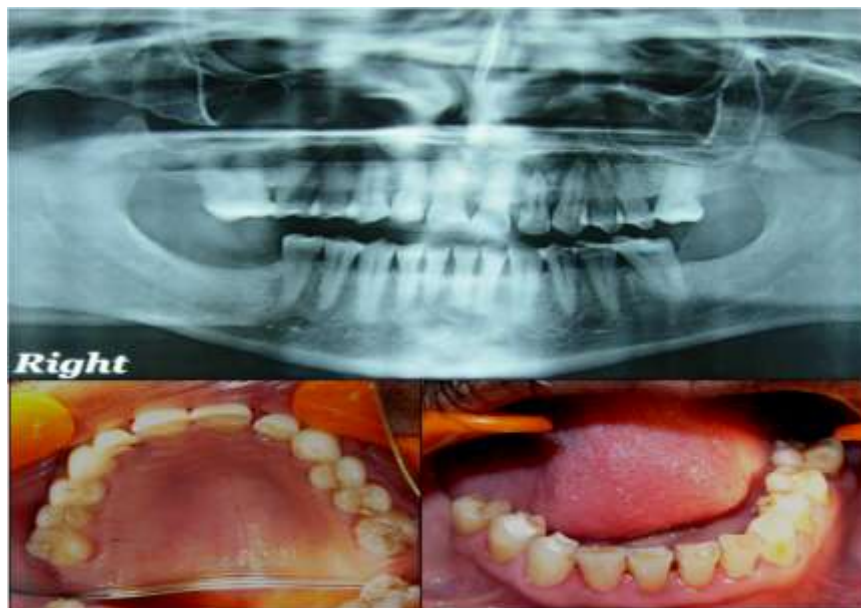
Fig. 2: OPG and clinical pictures show missing molar except 26