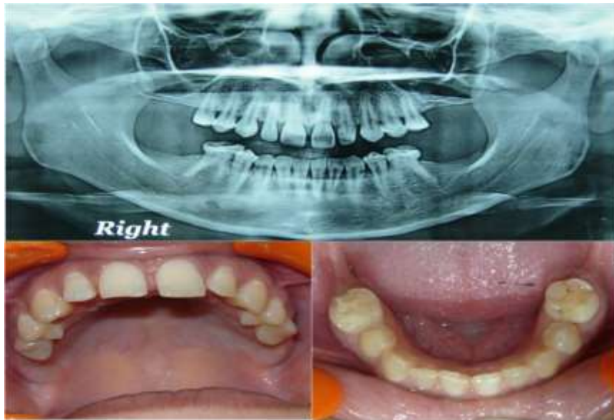
Fig. 1: OPG and clinical pictures show missing permanent molars