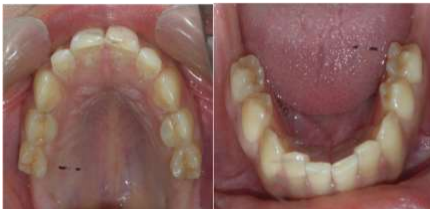
Fig. 3: Clinical pictures show missing molars