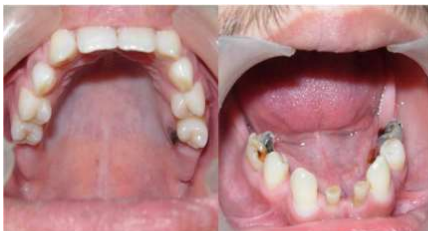
Fig. 5: Clinical pictures show missing posteriors and lower anteriors