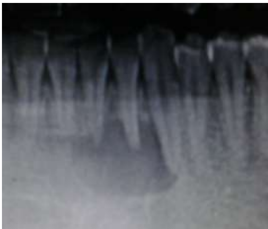
Fig. 2: Intraoral periapical radiograph showing well defined radiolucency with sclerotic border irt 31, 32, 41, 42