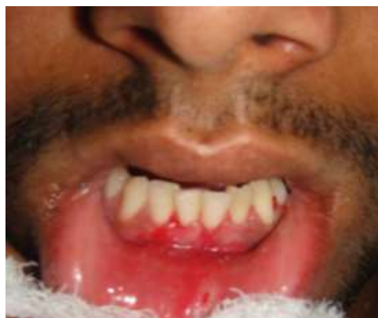
Fig. 1: Intraoral examination showing erythematous area with inflamed gingiva irt 31, 41, 42

Patient was under 6 months follow up and no recurrence or complications were noted.