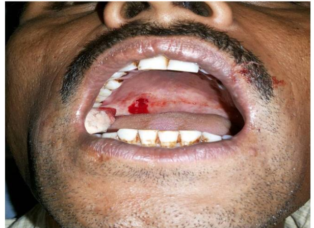
Fig. 4: After surgical excision (Case 2)