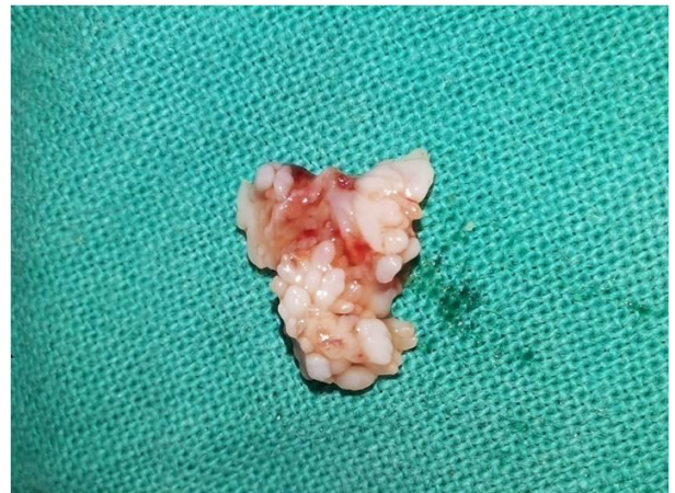
Fig. 5: Gross specimen (Case 1)