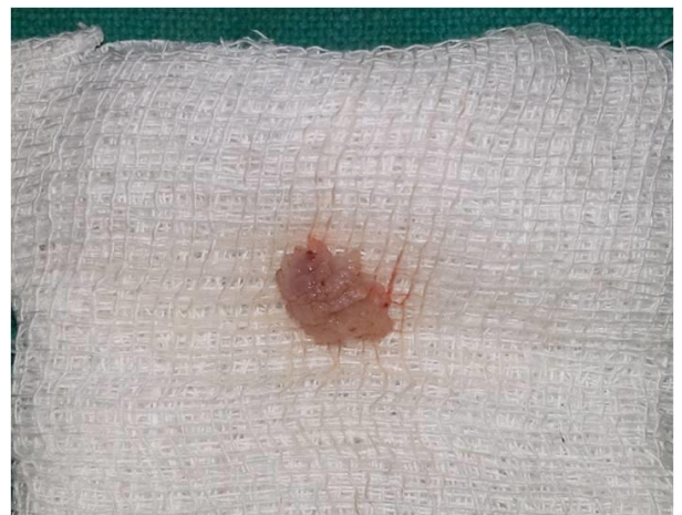
Fig. 6: Gross specimen (Case 2)