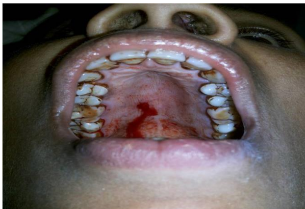
Fig. 3: After surgical excision (Case 1)