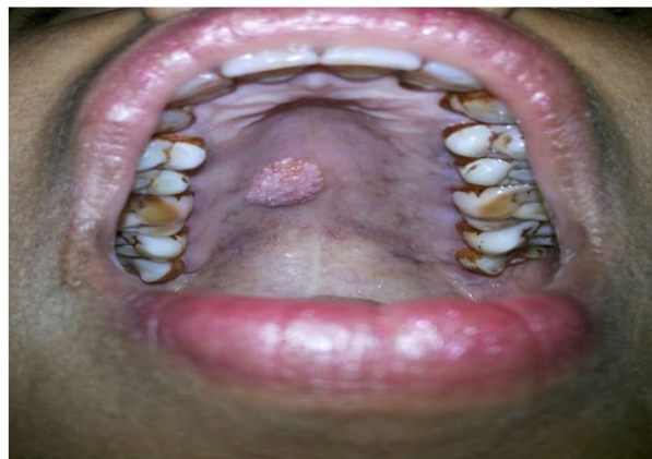
Fig. 1: Intraoral Clinical Appearance (Case 1)

On intra-oral examination, a solitary growth was present on the posterior hard palate, towards the right of the midline. Growth was roughly ovoid in shape, approximately 2 cm in diameter, pink in color with a lobulated surface giving a cauliflower like appearance. On palpation, it was pedunculated in nature, soft and firm in consistency and non tender to touch. (Fig. 1)