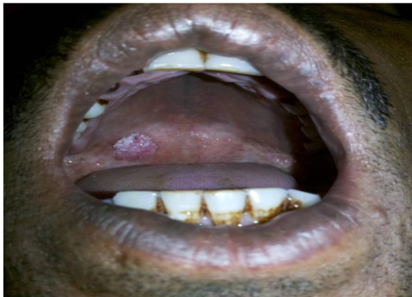
Fig. 2: Intraoral Clinical Appearance (Case 2)

Patients were on follow up with us for 1 year and there was no recurrence till then.