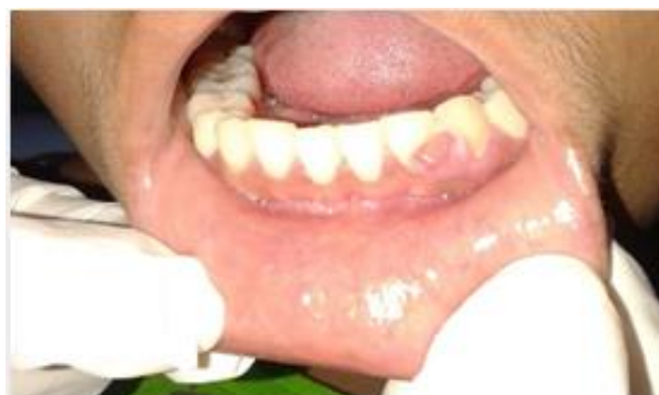
Fig. 1: Intraoral photo showing gingival overgrowth in relation to 32, 33 region

extravasated red blood corpuscle's.(Fig. 4) The above features were suggestive of lobular capillary haemangioma.