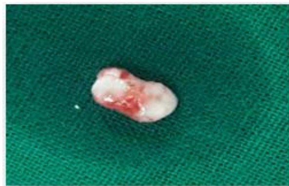
Fig. 2: Excised biopsy specimen