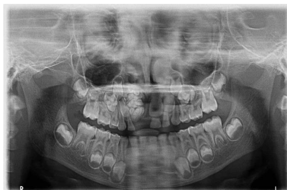
Fig. 4: An orthopantogram showing a predominantly radio-opaque mass similar in density with calcified dental tissues, with small radiolucencies located w.r.t 53 and congenital missing of 51 11 12 teeth