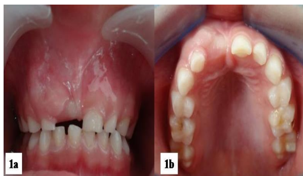
Fig. 1: a: Intraoral photograph showing unerupted maxillary deciduous right central incisor and a hard swelling in maxillary anterior right region