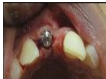
Fig. 8: Review after one week