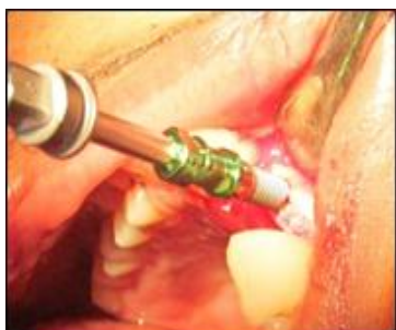
Fig. 4: Insertion of implant fixture