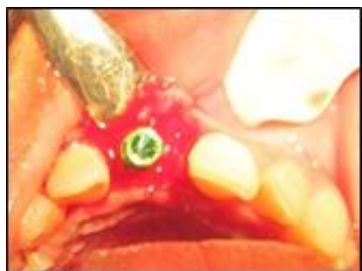
Fig. 5: Implant fixture inserted