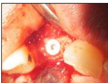
Fig. 6: Cover screw placed