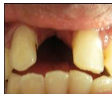
Fig. 1: Site for implant placement

The clinical parameter of bone loss, bleeding on probing was compared with the actual crestal bone loss. The 13 patients who had no bleeding on probing had only crestal bone loss less than 1.5mm. One patient with crestal bone loss less than 1.5 had bleeding on probing. Though clinically there is an association between bleeding on probing and crestal bone loss statistically there was no significant association as p value was 0.515. The single patient with score one in Wong-Baker faces scale was evaluated for crestal bone loss, radiolucency and peri-implant soft tissue changes. Crestal bone loss was between 1.5-2 mm. But as the p value (0.117) was not significant it is considered as there is no significant association between the pain experienced by the patient and the crestal bone loss. Similarly the association between pain and radiolucency was not statistically significant (p value 0.554). Fig. 1- 8 shows steps in implant placement.