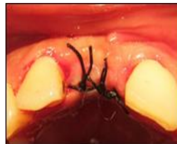
Fig. 7: Sutured site