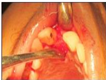
Fig. 2: Mucoperiosteal flap reflected