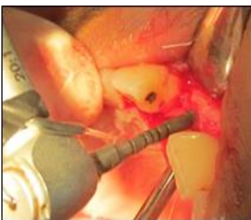
Fig. 3: Use of pilot drill