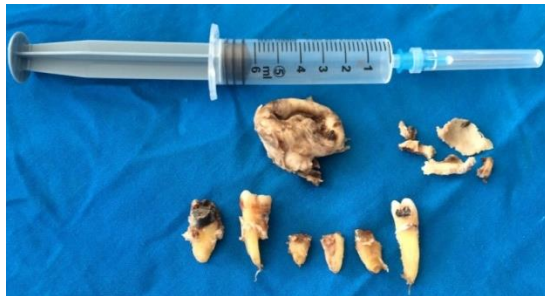
Fig. 4: Gross specimen- lesion enucleated in a single piece, bony fragments and extracted teeth