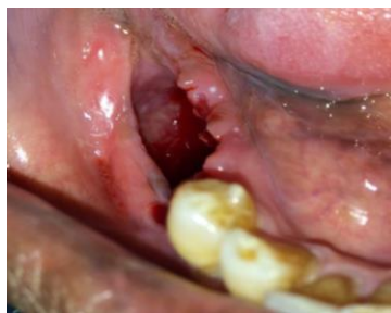
Fig. 5: 1 ½ month post-operative showing considerable healing