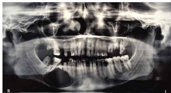
Fig. 2: Panoramic radiograph showing a well-defined, unilocular, radiolucent lesion associated with 46 and displaced roots of 47