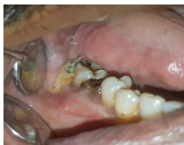
Fig. 1: Intra-oral vestibular swelling in relation to 45-47

Radiographic examination revealed a unilocular radiolucency associated with first molar tooth extending up to the inferior border of the mandible with a well-defined radiopaque border. The distal root of the first molar appeared to be resorbed and that of the adjacent second molar tooth were displaced [Fig. 2]. A cone beam computed tomographic imaging was done to locate the extent of the lesion and its proximity to the inferior alveolar neurovascular bundle. Considerable expansion and thinning of the buccal cortical plate was appreciated. Based on the above clinical and radiographic features, we established a final diagnosis of Radicular Cyst and proceeded with the surgical treatment after adequate control of his blood sugar level.