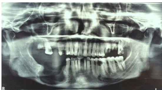
Fig. 6: 3 months post-operative panoramic radiograph showing evidence of bone healing