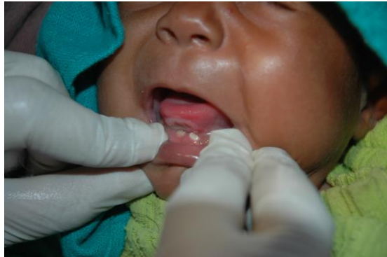
Figure no. 2: Intraoral photograph showing an indurated erythematous ulcerative lesion on the ventral surface of tongue.

A conservative management was planned by smoothing the incisal margins with the help of finishing stones attached to slow speed contraangle hand piece. The management of sharp incisal edge was combined with a therapeutic approach using a topical corticosteroid given for one week for its anti-inflammatory action. After one week, mother reported with improvement in feeding practice of child and ulcer showed signs of healing. Patient's guardians were advised to give follow up after every month, but they didn't reported back.