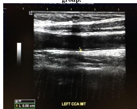
Fig. 2: Ultrasonogram image of LEFT CIMT