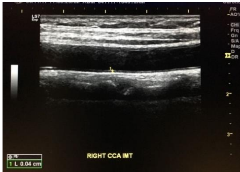
Fig. 2: Ultrasonogram image of LEFT CIMT