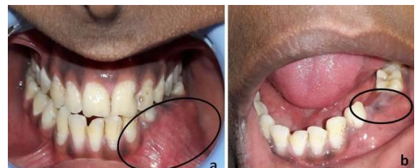
Fig. 2: Intra-oral view showing mild obliteration of left buccal vestibule (a) and missing 33 (b)