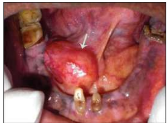
Fig. 4: Hydatid cyst in floor of mouth resembling ranula

Diagnosis of the cyst is based on patient's history, clinical features, radiological examinations, biochemical examinations and histopathology. Histopathology remains the gold standard for diagnosis.