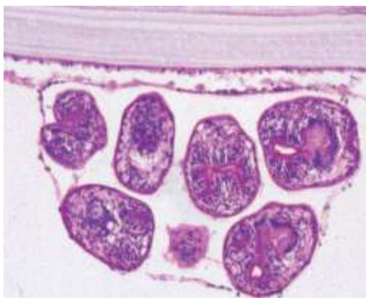
Fig. 5: Intermediate and inner germinative layer

Histopathology is the ultimate diagnostic aid. Intra oral cysts have shown 3 layers. 1 outer host layer and 2 inner parasitic layer. The host layer consists of fibrous tissue with chronic inflammatory cell infiltration, eosinophil and giant cells. The intermediate layer is white, non-nucleated and consists of many delicate laminations. The inner layer is nucleated germinal layer. The brood capsules or daughter cysts develop originally as minute projections of the germinative layer which further develops central vesicles and forms minute cysts. 8 [Fig. 5]