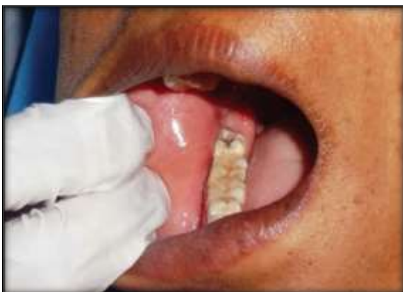
Fig. 3: Hydatid cyst in buccal mucosa

Very rarely these occurs intraorally. First reported in 2000 by Bouckaert et al. by reporting 2 cases of intra oral