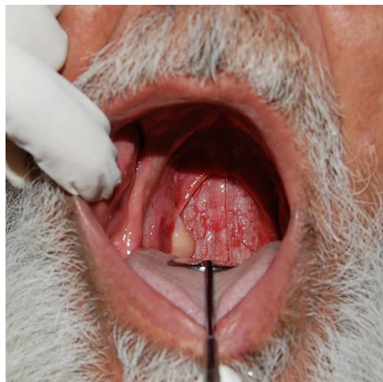
Fig. 1: Preoperative photograph showing the growth in the right tonsillar area.

Excisional biopsy (Fig-2) was done under local anaesthesia & the specimen was sent for histopathological examination (Fig-3) which revealed the structure of fibroma. Patient was recalled after 1wk for the follow up (Fig-4).