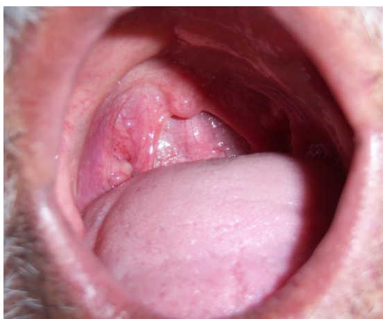
Fig. 4: Follow up after 1wk